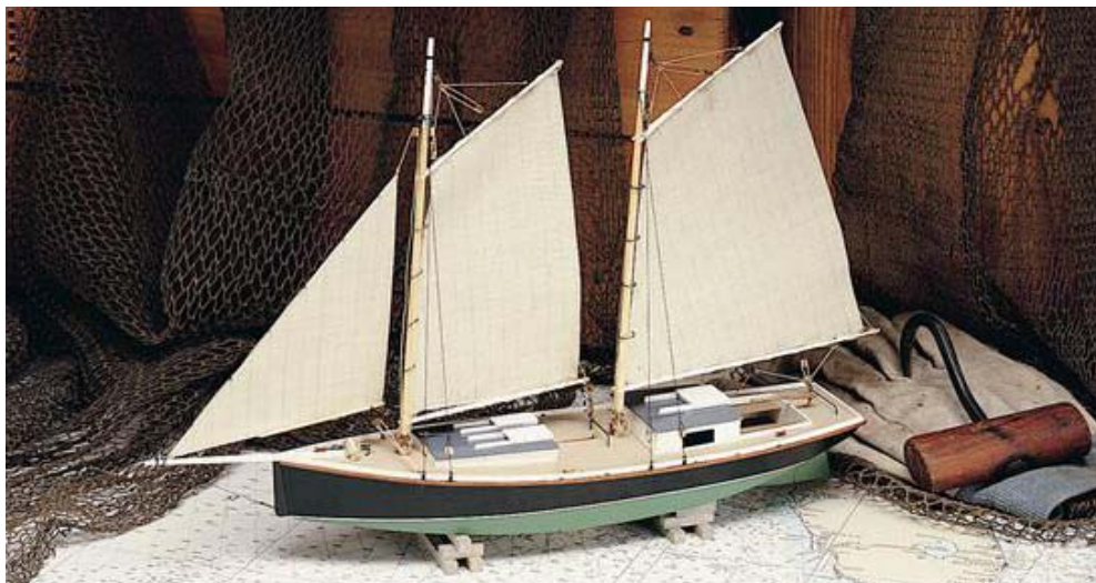
77-968 SHARPIE SCHOONER Length: 17", Beam: 3-3/4", Height: 12", Scale: (1/32), Hull Construction: Die-cut side & bottom planking