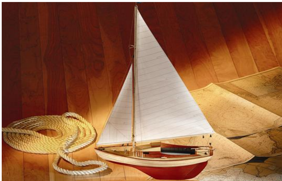
77-997 JOHN ALDEN SLOOP Length: 14-5/16", Beam: 4-11/16", Height: 24-1/2", Scale: (1/16), Hull Construction: Basswood Strip Planking