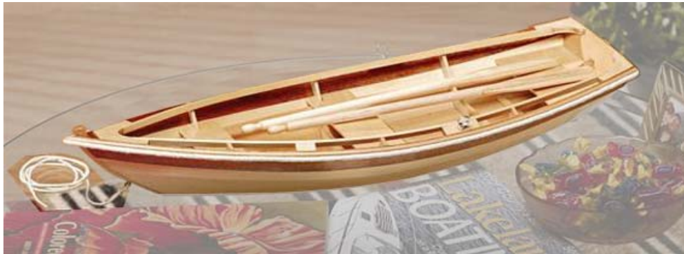
77-948 1/6 ROWING DINGHY Length: 20", Beam: 7-13/16", Height: 4-3/8", Scale: (1/6), Hull Construction: Die-cut Lapstrake Planking